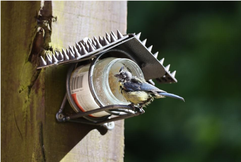
'Punk' Blue Tit